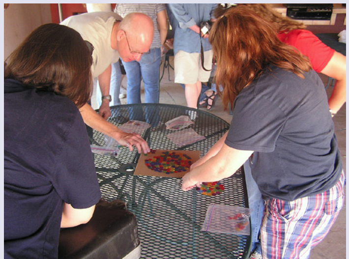
My! What Big Eyes You Have, JWST. Using counting disks and circles of various sizes, the Girl Scout leaders visualize the arithmetic associated with light-gathering area and are able to "see" how much more light JWST will gather relative to the human eye and why bigger is better.