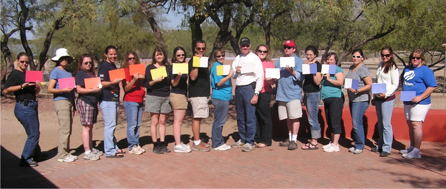
Constellation and Planet-Sorting Cards. Leaders participate in two separate activities — classification of stars, and the classification of the objects in our solar system (and extra-solar planets). Constellation Sorting Cards enable participants to sort according to various stellar parameters such as luminosity, temperature, apparent brightness, diameter, distance, etc. A more advanced set includes absolute magnitudes, types, and spectral classes. Planet Sorting Cards show information about the planets, dwarf planets, asteroids, comets, and satellites. Their orbits are also shown. There are two card sets with grade-appropriate information. The more advanced set includes several extra-solar planets.