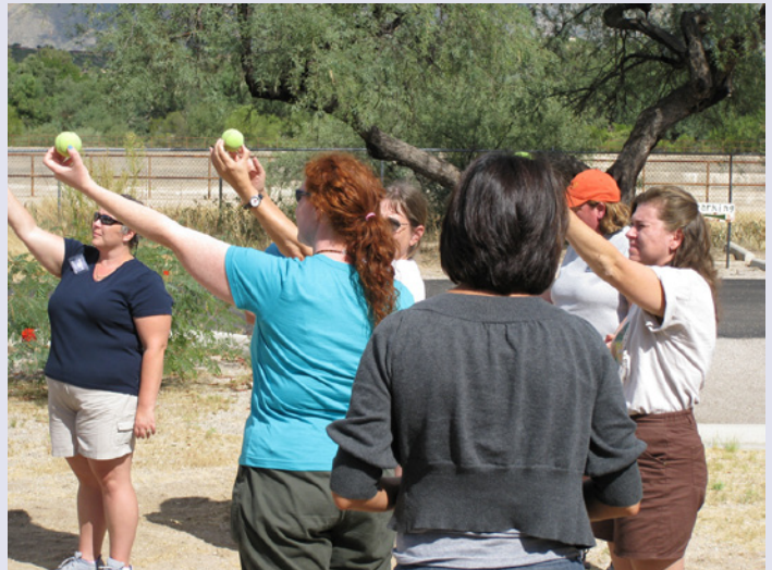
Lunar Phases. The Earth-Moon system can be modeled by combining a tennis ball and penny separated by ten Earth circumferences. This combination can also be used in daylight to understand the concept of phases.