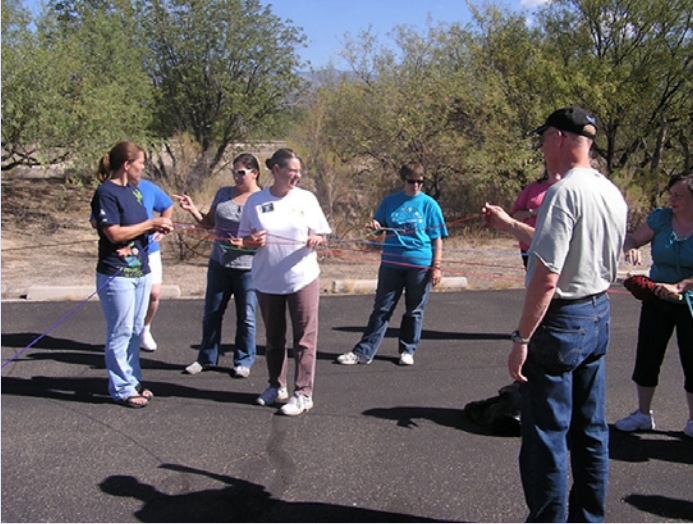
Macramé Solar System Distance Model. The relative distances of the planets from the Sun are modeled to scale, and in the correct relative orientation, using macramé.