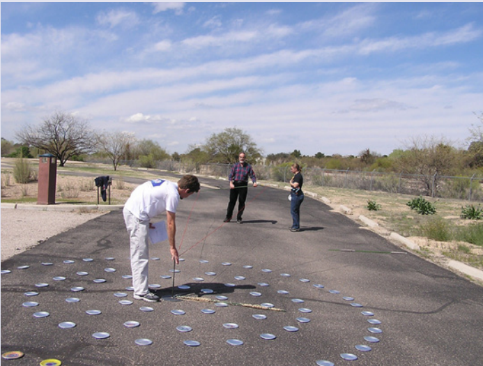
Human Orrery. This model is based on the Human Orrery at the Armagh Observatory in Northern Ireland. Participants can model day and night, the motion of the planets in their orbits around the Sun, and the positions of the planets in the sky from the perspective of the Earth. There are also plates to show the positions of the 13 zodiacal constellations. A more detailed description of the orrery's construction, as well as its use for STEM education, will be available (in 2011) in the ASP's Boulder meeting Conference Series book.