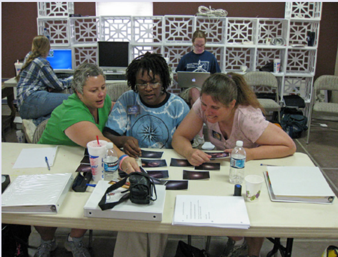
Galaxy Classification and Hubble Deep Field Images. Through the use of colored images of prominent galaxies and interacting pairs, teams of leaders first develop their own classification system. Then we progress to learn about galaxy evolution, the scale of the universe, the Hubble Deep Field images, and so on.