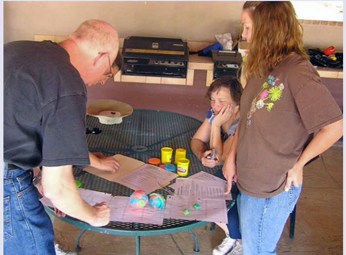
Relative Sizes, Planetary Diameters. The relative sizes of the planets are modeled using clay, beads, and Styrofoam balls.

The series of images in this poster paper highlight several of the activities we conduct during a typical three-day long workshop.