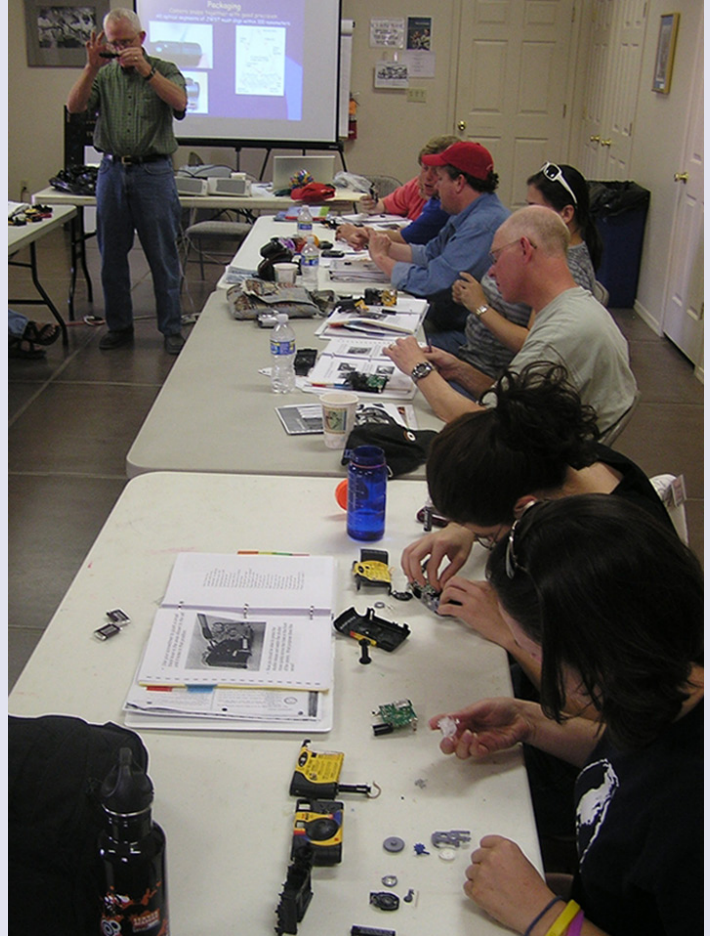
Comparing JWST/NIRCam With a Disposable Kodak Camera. The opto-mechanical and electrical components of a used, Kodak disposable camera provide an excellent analogue for experiencing the design of the NIRCam instrument. Girl Scout leaders dissect a disposable camera in order to discover the various subsystems and how they work together.