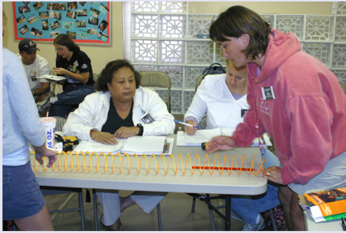
Hubble’s Law. To the general public the expansion of the universe is often a confusing, and potentially threatening, concept. However, this concept is essential to understanding the mission and science from JWST. To teach this concept, we engage our leaders in measuring motions of familiar objects like cars and Slinkys, as well as simulated galaxies in an overlapping set of overhead transparencies produced at different levels of enlargement.