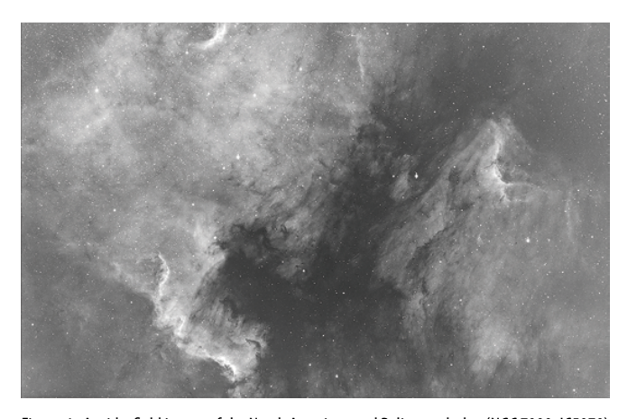
Figure 4: A wide-field image of the North American and Pelican nebulae (NGC 7000; IC5070) obtained in the emission of hydrogen-alpha. This image was obtained from the Takashi refractor mounted on the Kitt Peak Visitor Center 0.5-m telescope as part of the Advanced Observing Program of KPNO.

An unusually fun and educational experience came each night while watching sunset through the main and auxiliary beams of the McMath-Pierce Solar Telescope. Each observation provided opportunities to discuss a variety of solar and atmospheric phenomena (Figure 5). Also, airplanes were visible as they transited across the Sun, sometimes showing their contrails either during transit or as they egressed the limb. A particularly unexpected phenomenon, first noticed by Camper Zoey Martin-Lockhart, was associated with the chromatic dispersion of the solar image; sunspots displayed the opposite orientation of color separation from the overall solar disk. Counselor Brandon Swift figured out an explanation, which we would be happy to share with anyone interested. Claude Plymate from the National Solar Observatory went out of his way to facilitate our use of the telescope and also provided several in-depth tours of the facility.