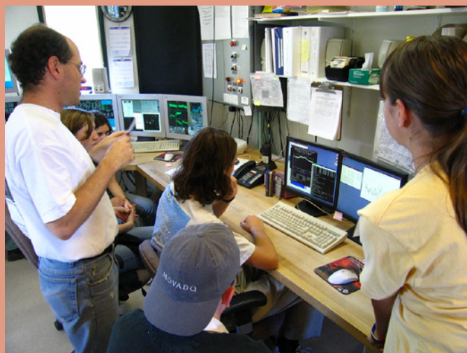
Students controlling the 10-meter submillimeter radio telescope on Mt. Graham.