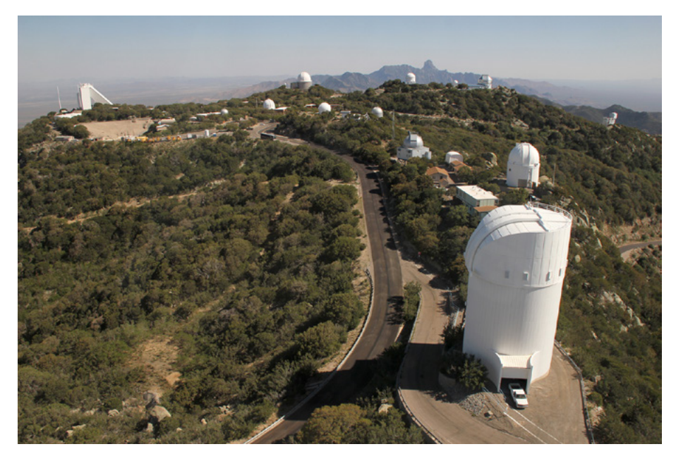
A fine view of the Observatory complex can be had from the public viewing gallery of the Mayall telescope. The 90-inch Bok reflector is in the immediate foreground; the McMath-Pierce solar telescope is to the far upper left.

My mild concerns dissolved by the time the road began winding between granite boulders, climbing its way up the mountain.