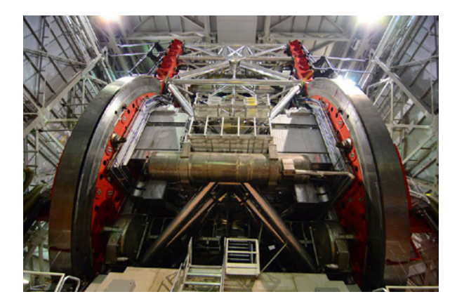
The Large Binocular Telescope uses two 8.4-meter mirrors supported by a massive structure.

A long drive up the mountain led us to the LBT, a colossal building surrounded by forest. The scientists of the LBT and the other two telescopes on the peak — the Submillimeter Telescope (SMT) and the Vatican Advanced