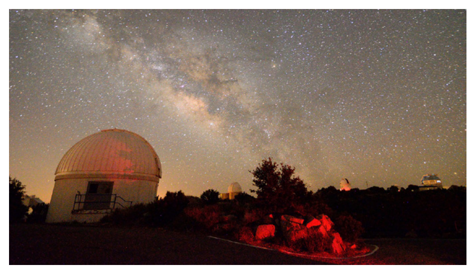
The beautiful Milky Way looms over Kitt Peak. Sometimes we'd just lie outside at night and stargaze.

Astronomy Camp let me solidify my love for the sky, but it also demystified my concept of the study of it. Being an astronomer is hard, complex work, but it is a crucially important field — one we young people, interested in space, can have an impact on. As long as we're under the same Moon, we can study it and what's beyond and always feel connected by looking outward.