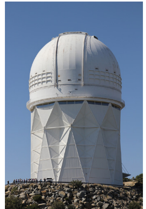
The dome of the 4-meter Mayall telescope dominates the peak. For scale, note the people and vehicles at the base of the structure.

That first night we viewed Arcturus, the Snowball Nebula, and Saturn through the 90-inch's occasionally used eyepiece (instead of spectrometers or CCDs operated from the control room, instruments we would become familiar with during the camp). The view of Saturn, unlike my six-inch scope's blurry, ricegrain-sized image of the planet, was clearer than my imagination. The shadow of the rings, pronounced sharply against the gas giant's sphere, kept my eye glued to the eyepiece.